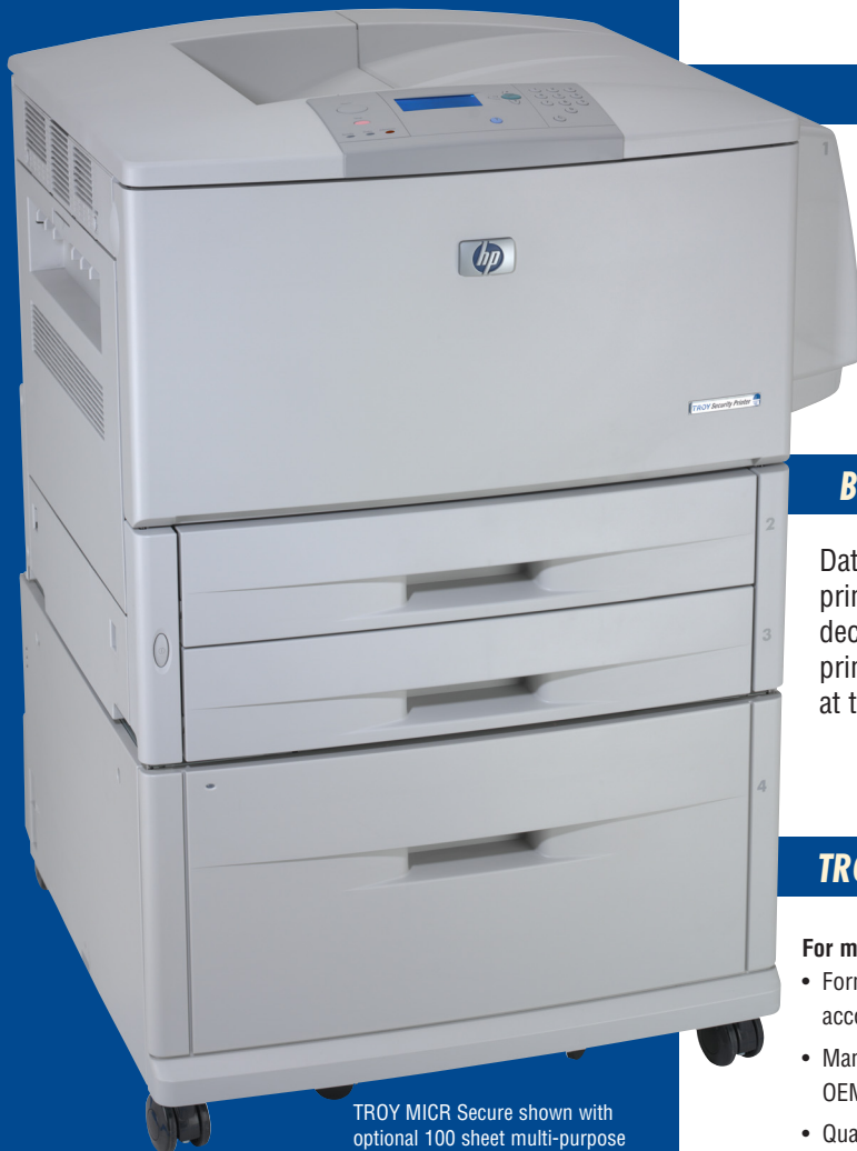
TROY MICR Secure shown with optional 100 sheet multi-purpose tray and 2,000 sheet input tray.